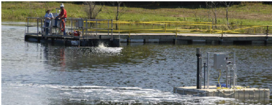
TVT BioJet and BioReactor

The standard BioJet is mounted on a 10' x 10' floating platform and includes a 15 HP blower with a Variable Frequency Drive to ensure optimum energy efficiency. The eductor venturi itself is located 6 feet below the surface in the second hydraulic layer. The combined horizontal directional flow of the BioJet and the Bioreactor ensures efficient mixing for maximum biological activity.