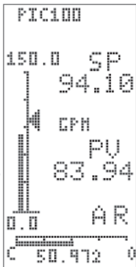
Single-Loop PID Control

In this strategy the controller accepts an analog input, compares it to the setpoint and generates an output. Its display includes a vertical bargraph indicator for the process variable, a 50 segment scale and setpoint indicator. Percentage output appears at the bottom of the display as a horizontal bar graph. The closed (C) and Open (O) valve indicators at the ends of the horizontal scale can be configured to be displayed at either end to indicate actual valve control direction. Digital values of the setpoint (SP) and process variable (PV) are shown along with auto/manual mode and local/remote setpoint status indication.